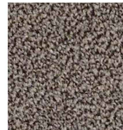
Plains | Bank 01313 | LRV 9.02

Each colour has a Light Reflectance Value (LRV) measured in accordance with BS8493:2008+A1:2010