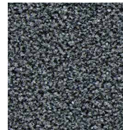
Plains | Westminster 01315 | LRV 5.61