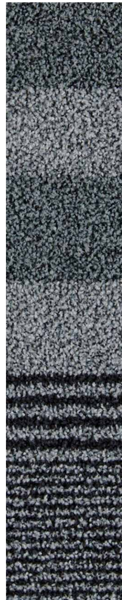
Stripes | Central Line 01355