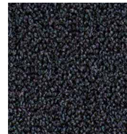
Plains | Farringdon 01310 | LRV 1.80