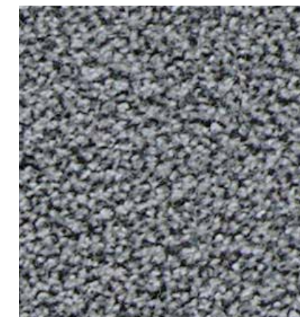
Plains | Euston 01314 | LRV 9.12